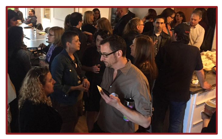
Digital Marketing Makeover event for small businesses and nonprofits.