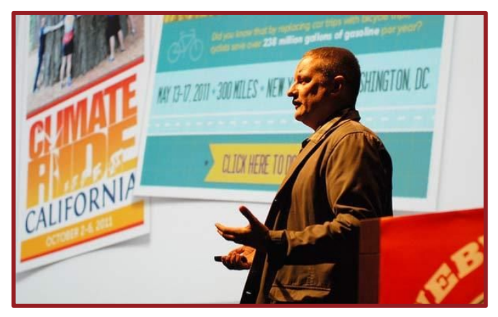
Helping industry professionals understand the importance of aligning mission and content strategy.

In 2016, we volunteered speaking and mentoring services for events and organizations around Chicago that help underserved communities. We also donated our office space to nonprofit organizations for events and hosted several industry and community education workshops throughout the year.